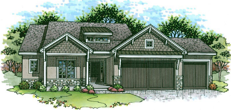
Craftsman with Front Porch