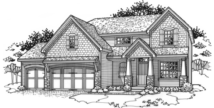
Traditional with Lap and Shake Siding