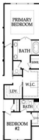
Alternate Primary Bath/Closest Layout