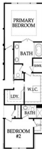
Alternate Primary Bath/Closet Layout