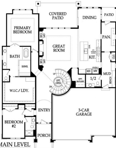
Main Floor Option 1