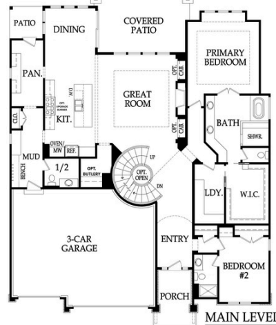
Main Floor Option 2